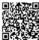
QR code of the LINE app

① Phone the Nishinomiya Waste Disposal Call Center ( Nishinomiya Gomi Denwa Uketsuke Center ) at 0798-33-6776. The amount of refuse acceptable for one household at one time is equivalent in volume to approximately two study desks.